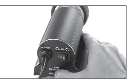
5. Adjust the RPM knob if necessary