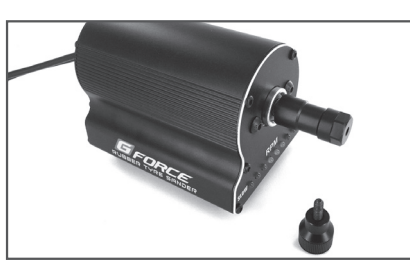
2. Remove thumb screw